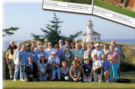
Society Members Tour Cape Arago Lighthouse, Oregon

To Join the U.S. Lighthouse Society and begin your subscription to The Keeper's Log Magazine... Call - 415-362-7255 or visit our website at www.uslhs.org