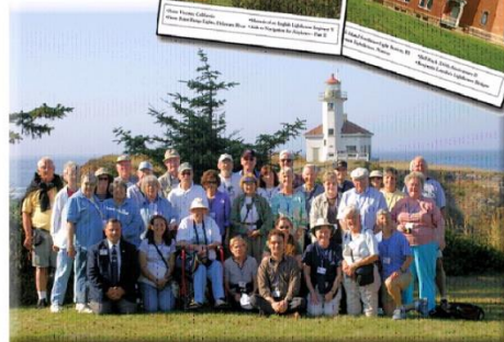
Society Members Tour Cape Arago Lighthouse, Oregon

To Join the U.S. Lighthouse Society and begin your subscription to The Keeper's Log Magazine... Call - 415-362-7255 or visit our website at www.uslhs.org