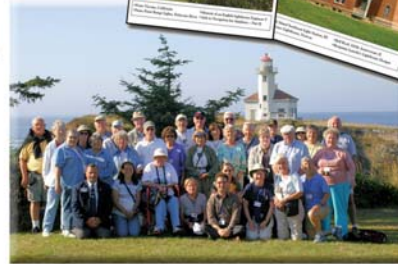
Society Members Tour Cape Arago Lighthouse, Oregon

To Join the U.S. Lighthouse Society and begin your subscription to The Keeper's Log Magazine... Call - 415-362-7255 or visit our website at www.uslhs.org