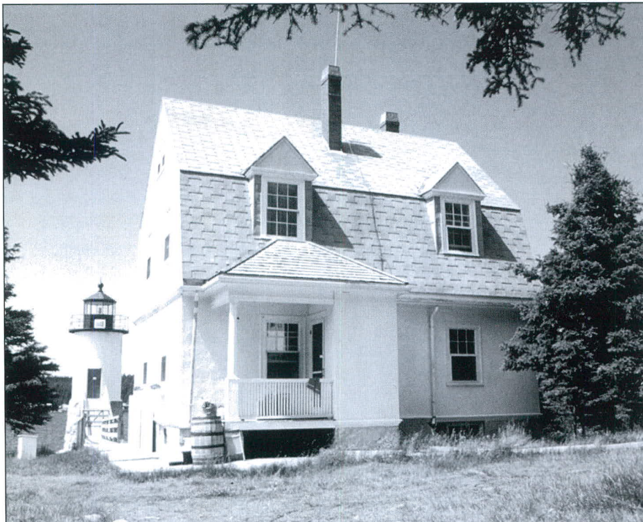
The Isle au Haut keeper's house and tower in 1990.

Lighthouse libraries will be incomplete without this fine work. This soft cover, 7" x 10", 266 page book has 63 black and white photographs, 20 drawings, and four maps. It is available through the Keeper's Locker for $24.95 plus $4.00 shipping and handling.