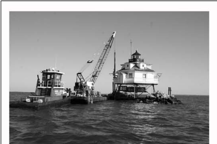
Thomas Point Shoal Lighthouse, MD

The U.S. Lighthouse Society has donated to many lighthouse preservation projects throughout the U.S. Most recently we were honored by being presented with the Preserve America Stewardship Award from The White House for our restoration work at Thomas Point Shoal Lighthouse.