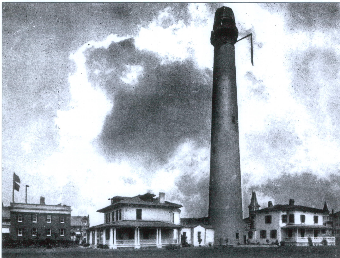
The Absecum Lighthouse in Atlantic City, New Jersey, circa 1903.