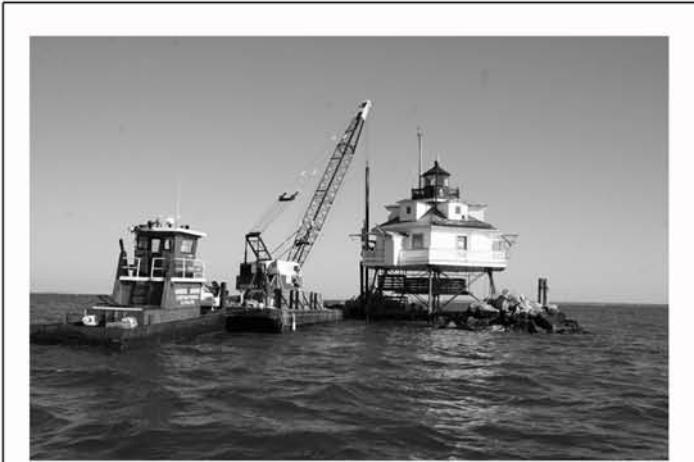
Thomas Point Shoal Lighthouse, MD

The U.S. Lighthouse Society has donated to many lighthouse preservation projects throughout the U.S. Most recently we were honored by being presented with the Preserve America Stewardship Award from The White House for our restoration work at Thomas Point Shoal Lighthouse.